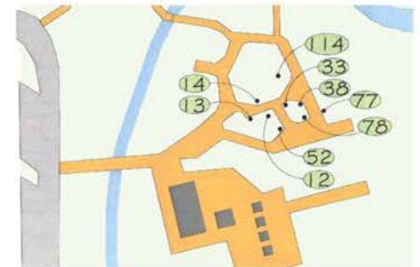
Significant Features & Places Key