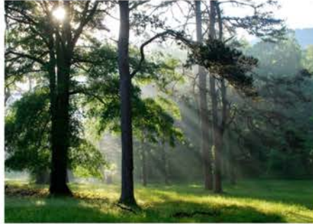
Great Trees of the Arboretum