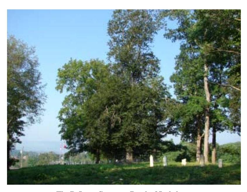
The DeLapp Cemetery Beech of Jacksboro.

The DeLapp Cemetery Civil War Beech (Jacksboro, TN). This beech stands in the Civil War Memorial Cemetery (once known as the DeLapp Family Cemetery) in Jacksboro. In 1862-63 the 58th North Carolina Confederate Regiment was encamped in this old family cemetery to guard Big Creek Gap of the Cumberland Mountains (now known as nearby LaFollette). In the winter of 1862 some 52 soldiers died of diseases and were buried in the cemetery. The large beech tree in the center of the cemetery is