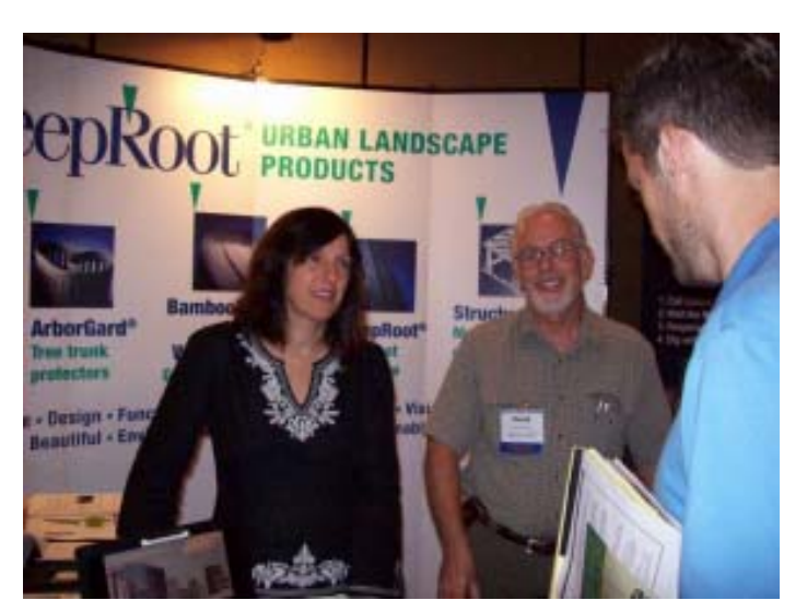
The Trade Show during the annual conference highlighted the green industry.