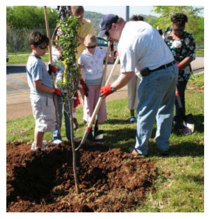
Knoxville Utility Board employees and Green Math and Science Academy fourth and fifth grade students planted six trees at the school to celebrate Arbor Day.